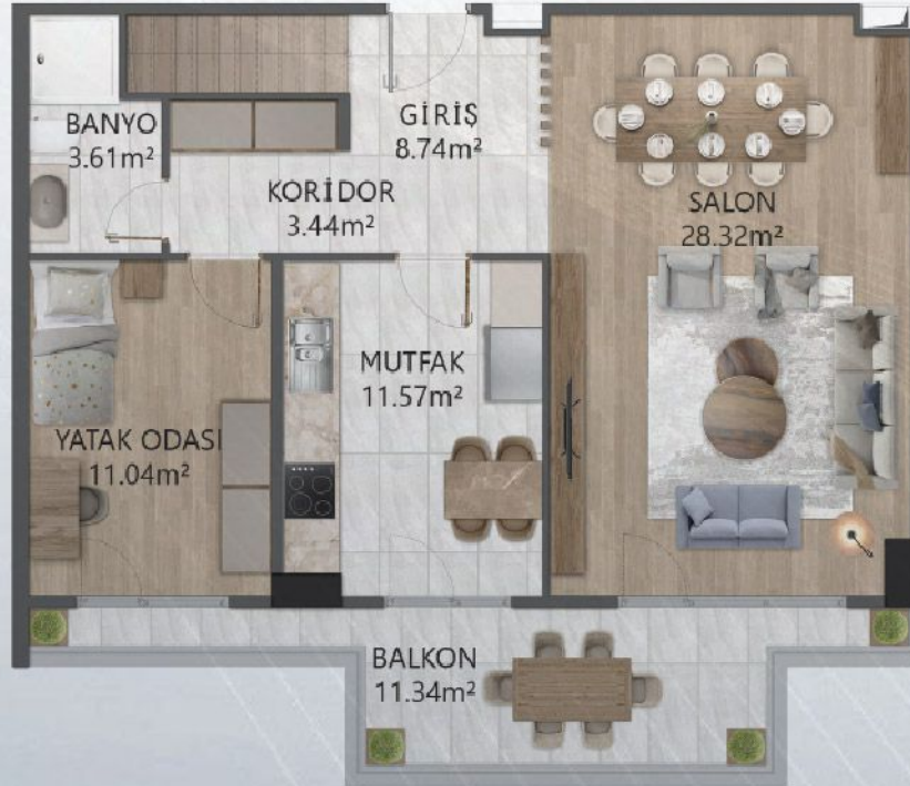
6.- 8.KAT DUBLEKS ALT KAT PLANI 6 th -8 th FLOOR DUBLEX LOWER FLOOR PLAN