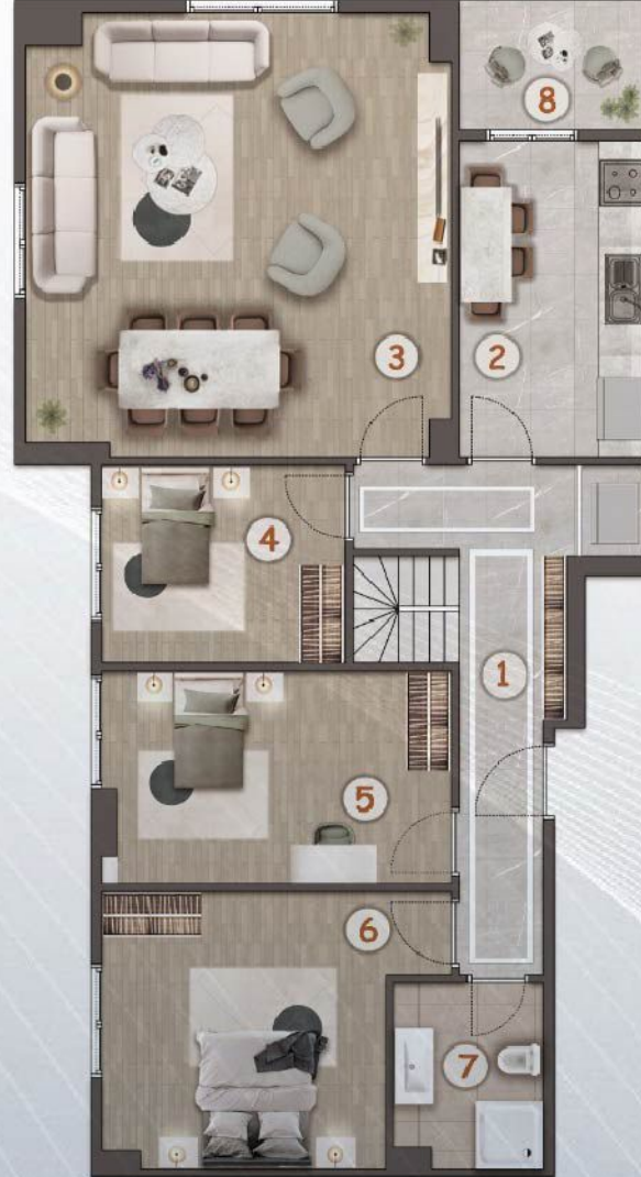
4. KAT PLANI