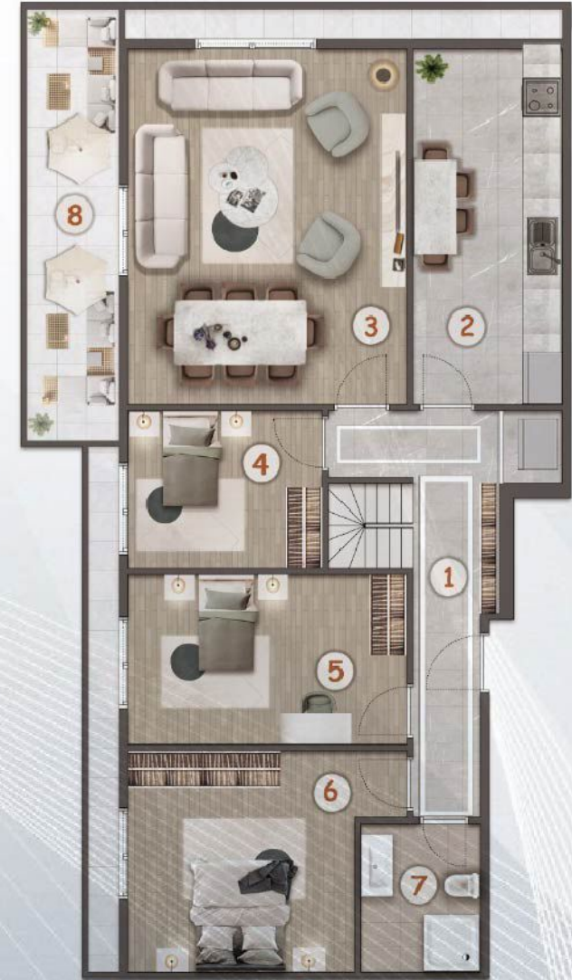
DUBLEKS KAT PLANI