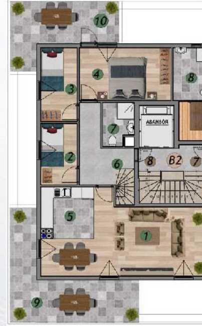
7+2 DUBLEKS ÜST KAT DAİRE PLANI