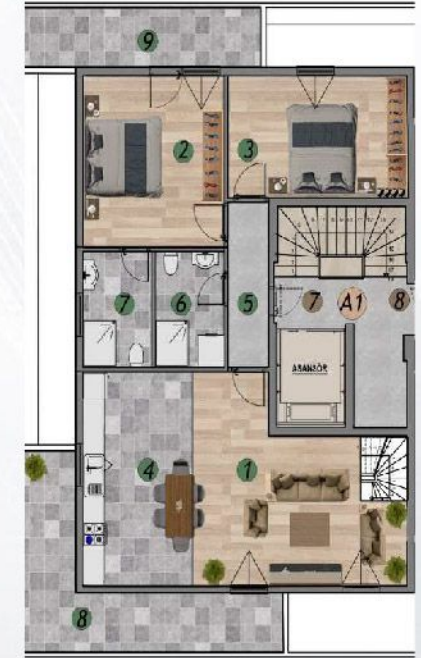
3+1 ALT KAT Net 124 m 2