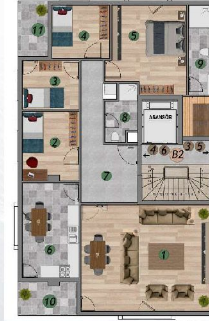
7+2 DUBLEKS ALT KAT DAİRE PLANI