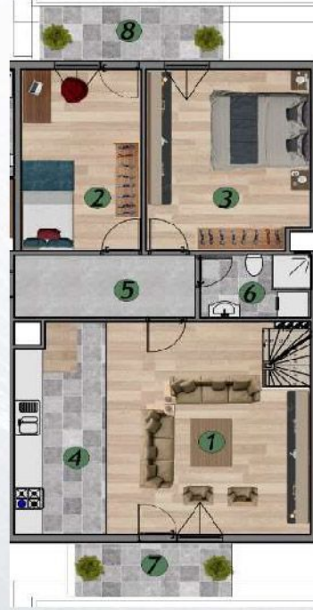
4+2 DUBLEKS ALT KAT DAİRE PLANI