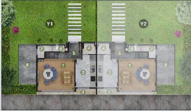
Bahçe Kat Planı