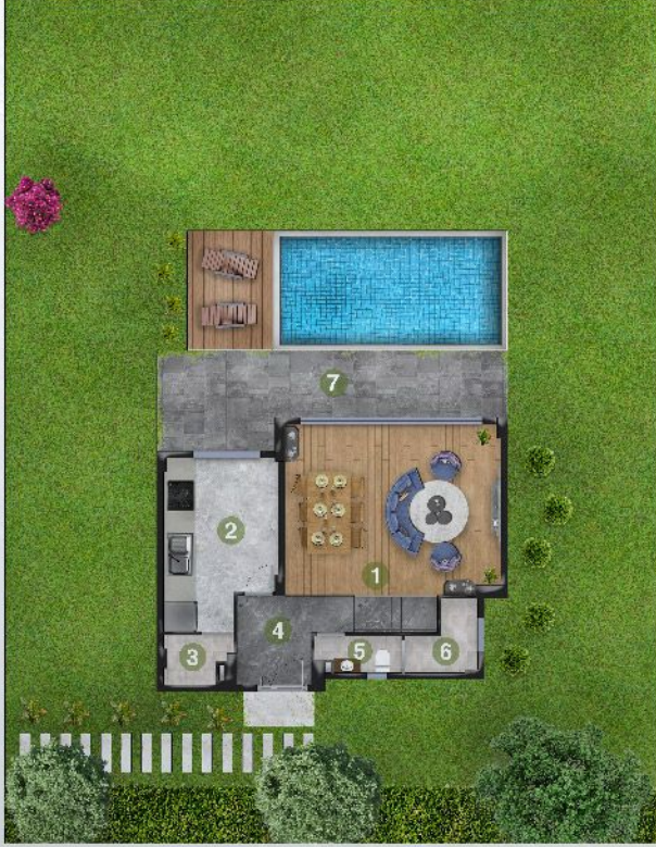
Bahçe Kat Planı