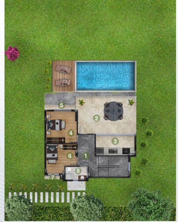
2. Kat Planı