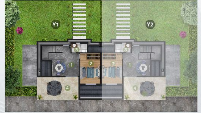
Çatı Kat Planı