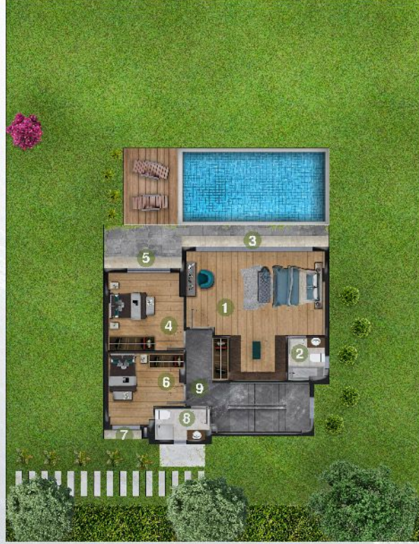
1. Kat Planı