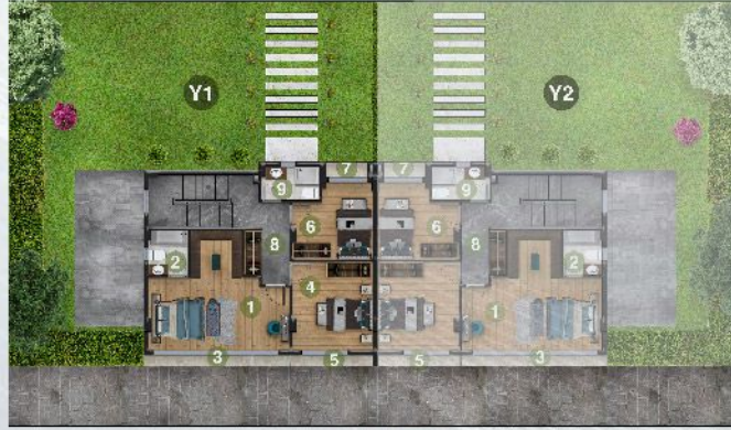
1. Kat Planı