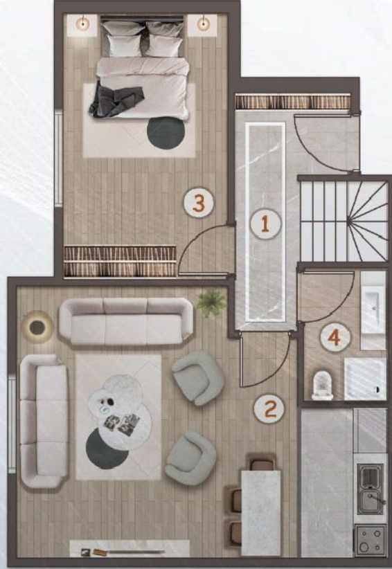
4. KAT PLANI