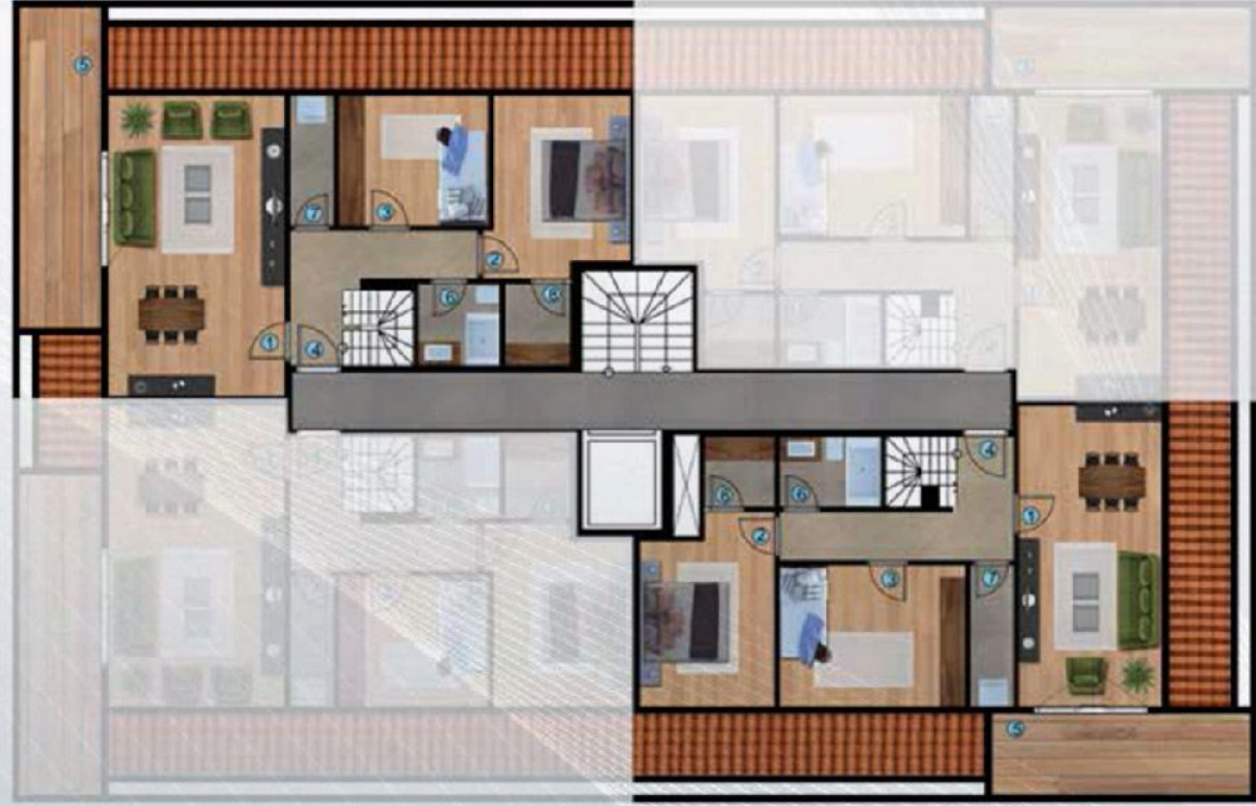
E BLOK ÇATI PLANI (DUBLEKS ÜST KATI)