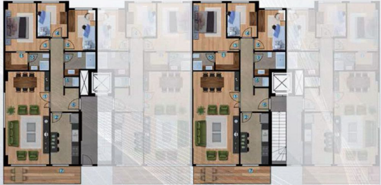
A-B VE C-D BLOK 1.BODRUM KAT PLANI ( BAHÇE KATI )