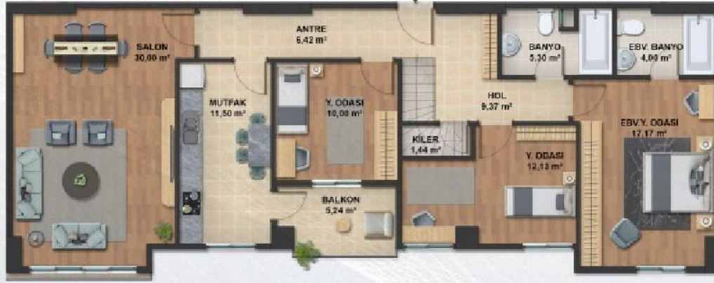
ALT KAT PLANI