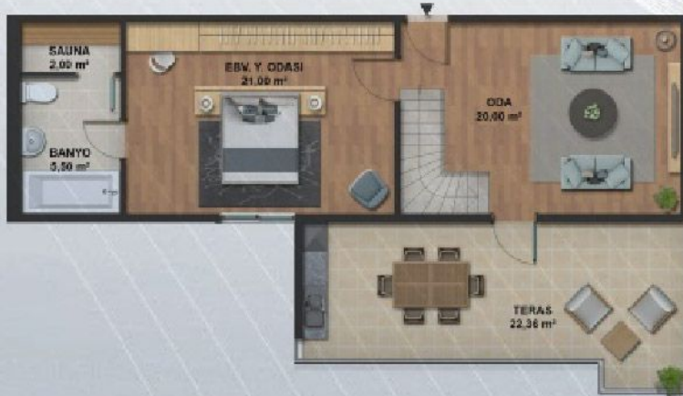
ÜST KAT PLANI