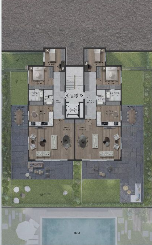
BODRUM KAT PLANI (+67.00 KOTU)