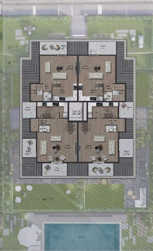
ÇATI ARASI PLANI (+76.00 KOTU)