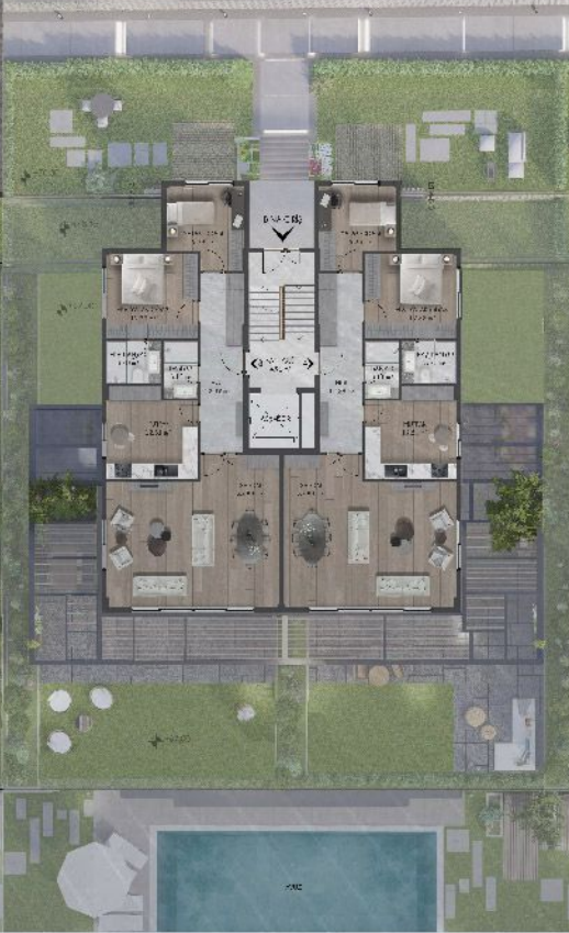
ZEMİN KAT PLANI (+70.00 KOTU)