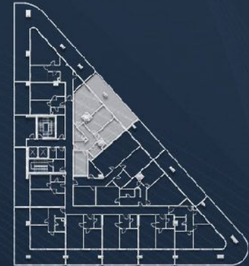
1-2-3. KAT ANAHTAR PLAN