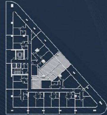
1-2-3. KAT ANAHTAR PLAN