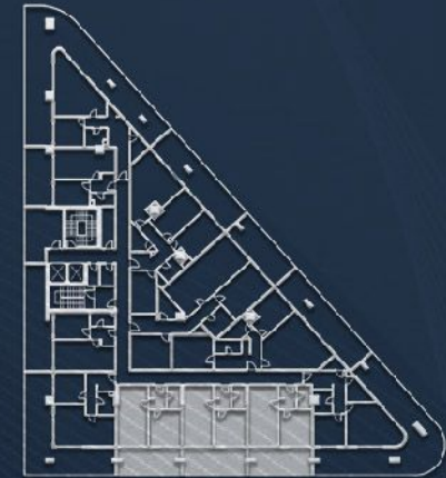
1-2-3. KAT ANAHTAR PLAN