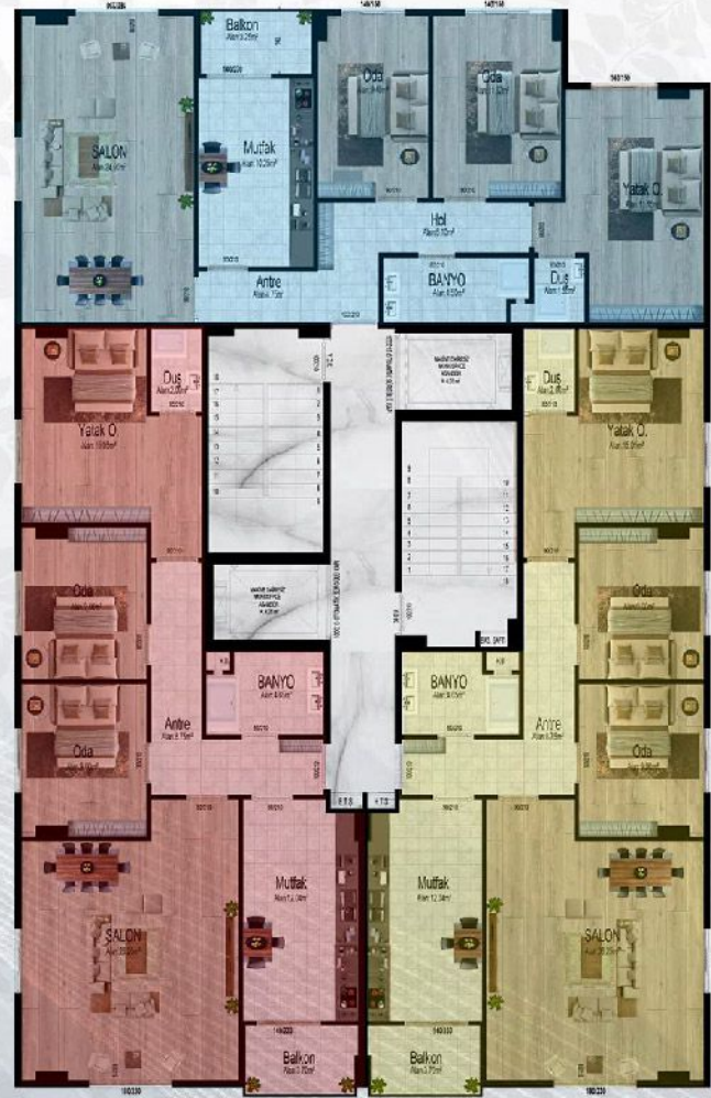
A Blok Kat Planı