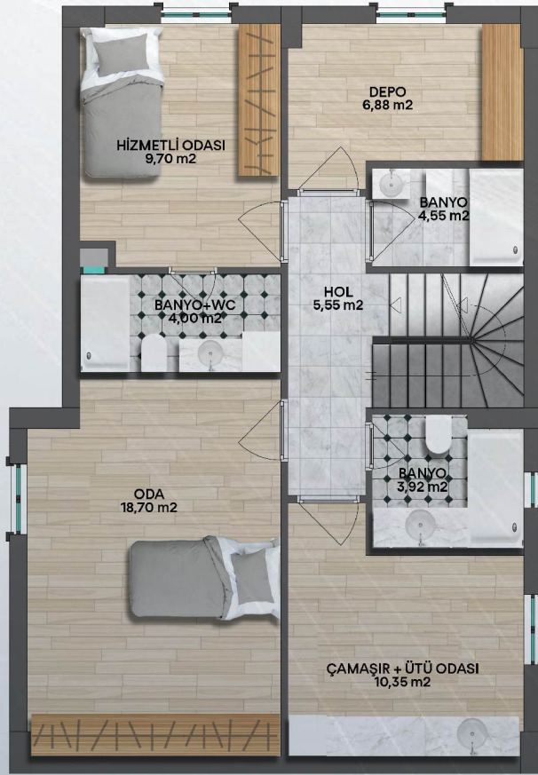
LAKE VILLAS BODRUM KAT PLANI