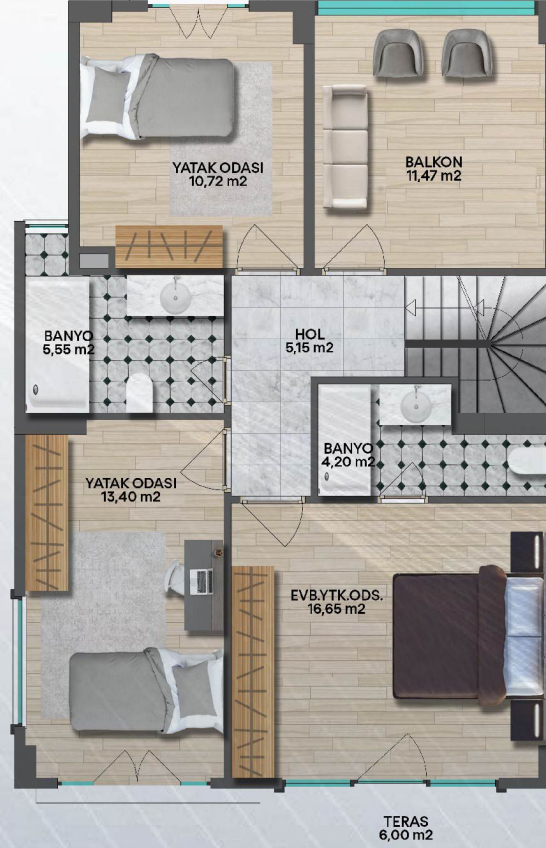
LAKE VILLAS 1.KAT PLANI