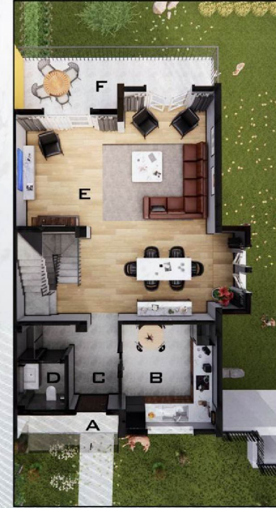
BODRUM KAT PLANI

NET ALAN:263.7M 2 BRÜT ALAN:305.9M 2 BAHÇE: 283.8M 2