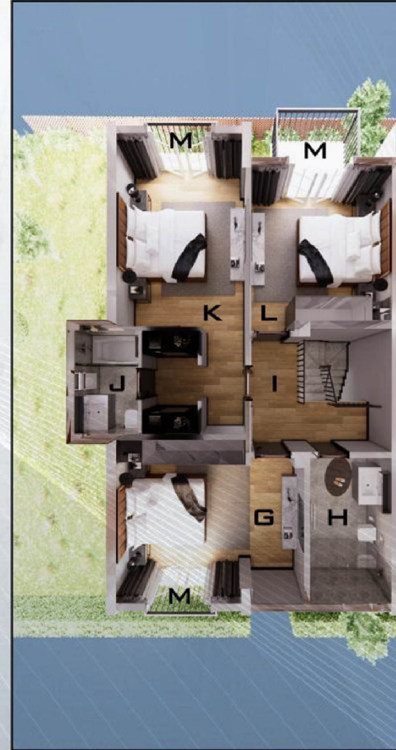
ZEMİN KAT PLANI

G:YATAK ODASI 18.6M 2 H:BANYO 7.5M 2 I:ANTRE 10.6M 2 J:DUŞ-WC 4.3M 2 K:YATAK ODASI 22.4M 2 L:YATAK ODASI 13.9M 2 M: TERAS 4.7M 2