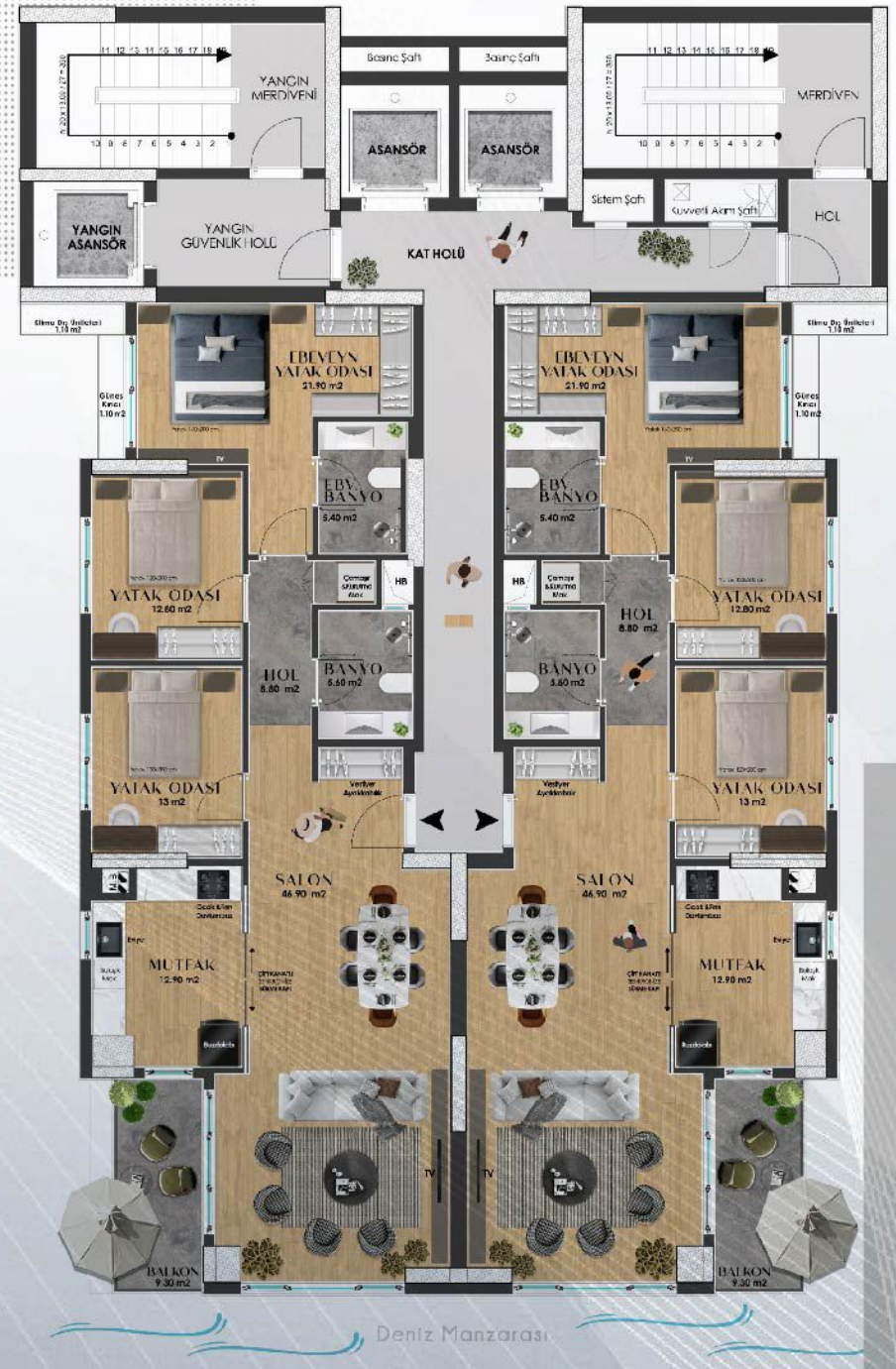
B Blok Yerleşim Planı