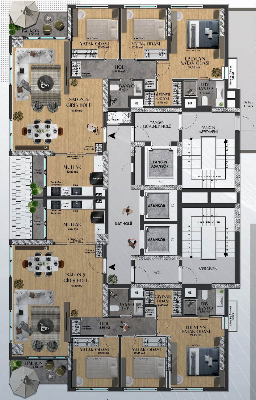
A Blok Yerleşim Planı