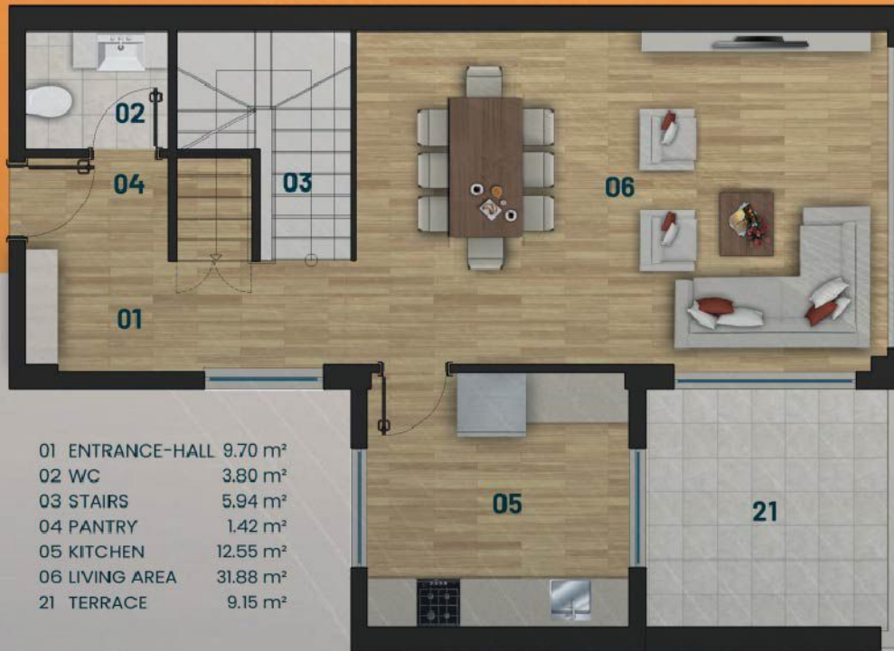
VILLA TYPE 01 | GROUND FLOOR PLAN