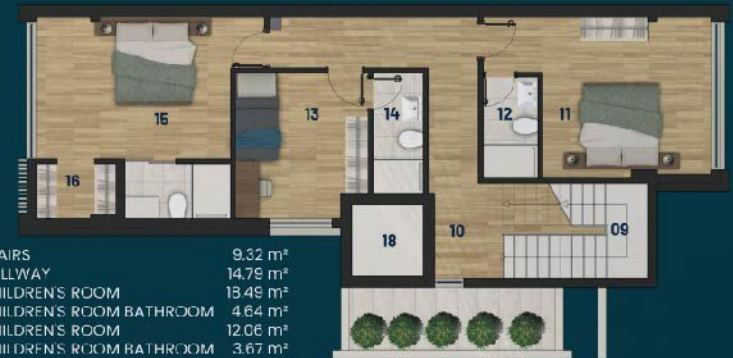
VILLA TYPE 02 | 1ST FLOOR PLAN