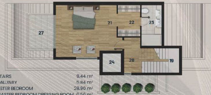
VILLA TYPE 02 | ATTIC FLOOR PLAN