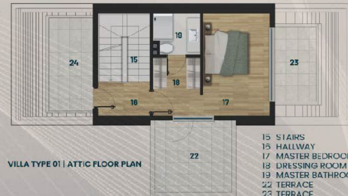
VILLA TYPE 01 | ATTIC FLOOR PLAN