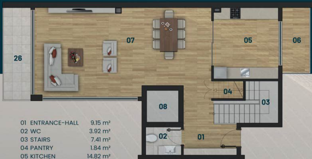
VILLA TYPE 02 | GROUND FLOOR PLAN